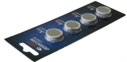
Battery Pack Strip P/N: 49010-S

Comfortable stretch nylon band with adjustable head that can be attached to any Guardian to make an effective head light. Can also be adjusted to fit wrist for hands free lighting.