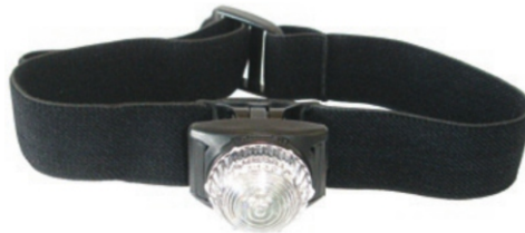
Head Strap P/N: 49006

Allows for easy attachment to most bicycles and poles.