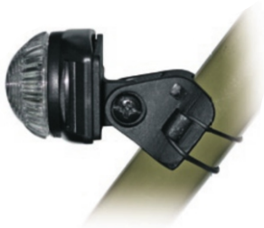
Bike Mount P/N: 49005

Stretch nylon strap that can be used to fasten the Guardian to the arm or wrist, or a multitude of other objects.