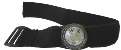
Wrist Strap P/N: 49004

6 inch velcro strap ideal for attaching the Guardian to pet collars, poles and other thin items.