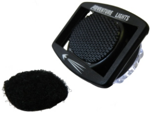
Helmet Attachment P/N: 49002

These simple two sided Velcro attachments allow for easy instalment onto the back of helmets for identification and crowd control coordination.