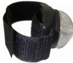
Velcro Strap P/N: 49003

These simple two sided Velcro attachments allow for easy instalment onto the back of helmets for identification and crowd control coordination.